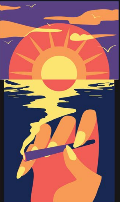
WAKE AND BAKE