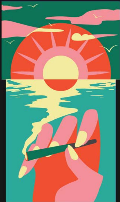
HASH IT OUT LATER