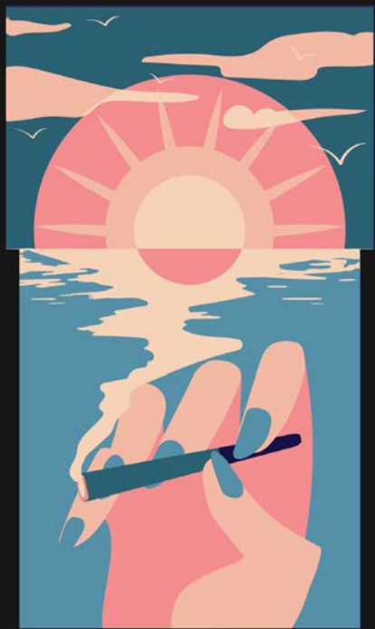
OVER THE HORIZON